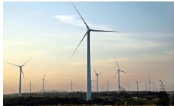
WIND FARM, MAHARASHTRA STATE

Private sector engagement. Complementing objective 4 described above, SAREP will scale pilot projects, leverage funding for grants, and advocate for better and more streamlined regulation at both the national and regional level to improve the private sector enabling environment and promote replication of successful approaches.