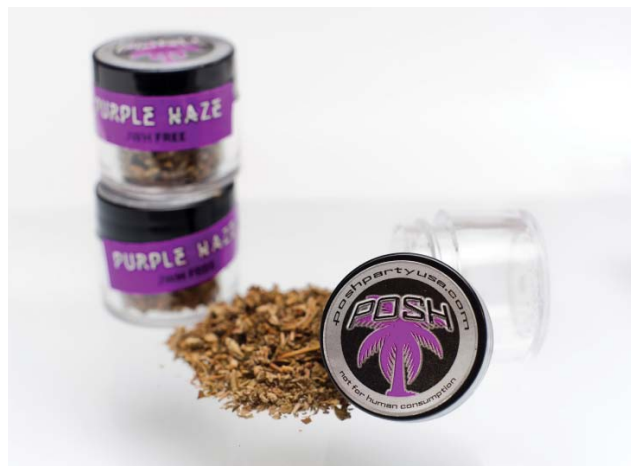
Figure 1. Purple Haze is one of the many herbal incense products containing synthetic cannabinoids

A few years ago, Huffman began receiving phone calls from law enforcement agencies, the military, and panicked parents, a situation that has continued since his retirement at the end of September 2010. The cause of this consternation was JWH-018, one of the cannabinoids Huffman designed and synthesized in his laboratory, because forensic scientists had identified it in herbal mixtures being marketed over the Internet as incense. Rather than using these herbal blends (e.g., Spice Gold, Spice Diamond, Purple Haze, K2, Skunk, and Smoke; see Figure 1) as incense, people were apparently smoking them for their marijuana-like effects (Vardakou, Pistos, & Spiliopoulou, 2010).