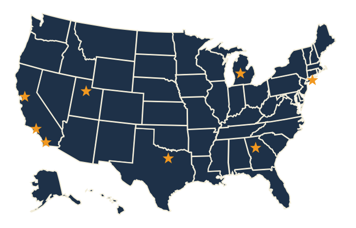
Figure 1. Locations of the 8 HTYPE Demonstration Programs

were designed to obtain more information about project planning and startup, including successes and challenges encountered over the course of Year 1. All interviews were conducted approximately 9 to 11 months after grant funding was awarded; therefore, interviews are best described as capturing reflections on the very beginning of the 3-year grant period.