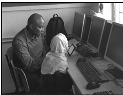
A child uses the EF Touch tool in Nairobi, Kenya.

RTI International is seeking partners to assist in systematic studies of EF Touch in other LMICs, with the expectation that modified versions will yield valuable information related to early education policy and practice.