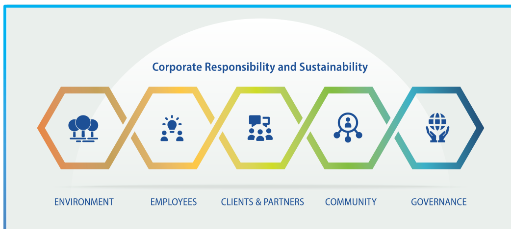
Figure 2. RTI’s Corporate Responsibility and Sustainability Program focuses on these foundational areas.

RTI is deeply committed to being a responsible steward of the environment and advancing corporate responsibility and sustainability across our operations. We view this as an ongoing journey that reflects our mission and responsibility to clients, communities, and the people our work serves. Because this commitment is integral to how RTI operates, we expect Suppliers to demonstrate a similar level of responsibility in managing environmental impacts, treating employees, serving clients, and conducting business ethically. RTI is also committed to fair and inclusive sourcing practices and works with Suppliers in a non-discriminatory manner.