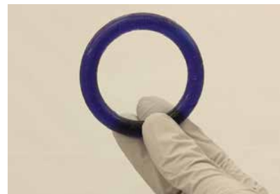
Figure 2. A vaginal ring drug delivery device prepared at RTI International

This simulated device (without drug) consists of silicone and a color-based indicator.