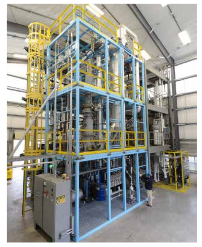
RTI 1-ton-per-day catalytic biomass pyrolysis pilot unit