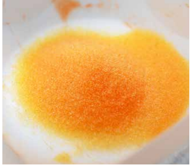
Fluidizable MOF particles

RTI maintains a philosophy of adapting commercial and scalable production practices early in the catalyst, sorbent, or membrane development process. We maintain close relationships with the major commercial catalyst manufacturers. This approach results in the straightforward and rapid scale-up of a majority of materials developed at RTI.