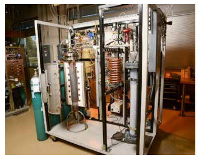
High-pressure, high-temperature fluidized-bed reactor