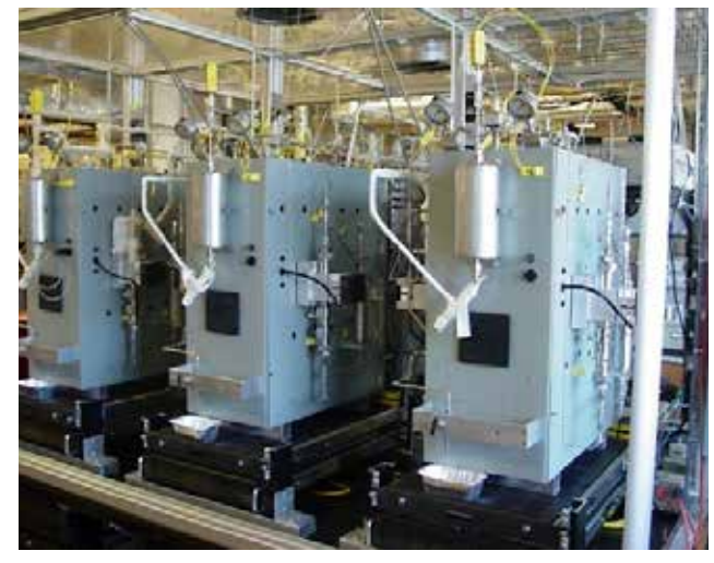
Lab-scale automated micro-reactor systems