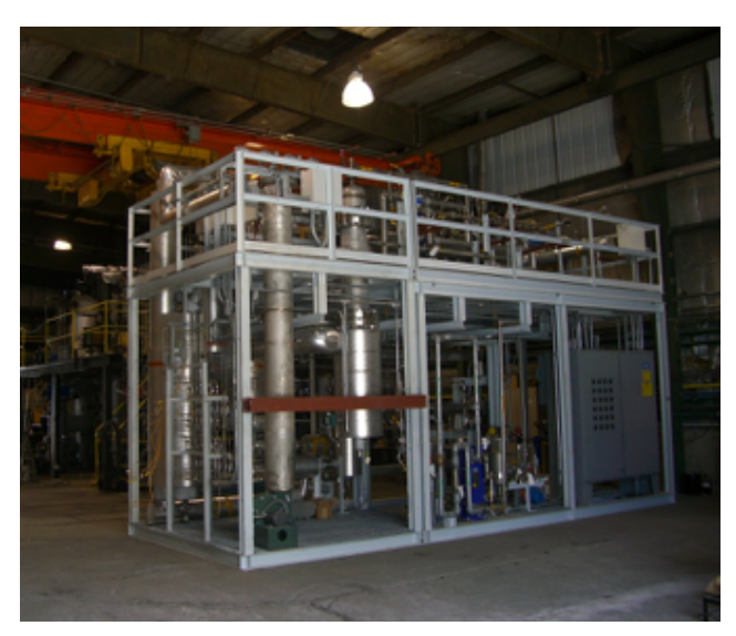
Fluid-bed test unit for tar cracking