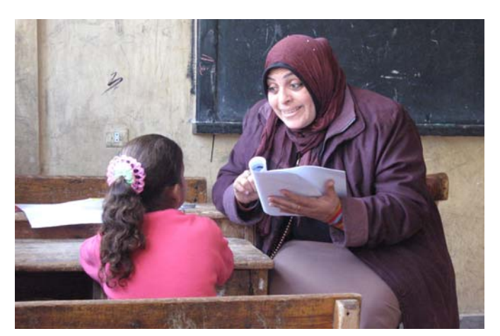
GILO piloted the Early Grade Reading Assessment (EGRA) in Arabic for the first time in Egypt.

To ensure that girls are granted full and equal access to quality education within schools, GILO has developed a range of girl-focused capacity building packages tailored to school leadership. These packages introduce administrators to effective school leadership and management techniques and support them in addressing challenges to girls' education in their annual school improvement plans. School social workers and board members learn to practice good governance and engage communities (women and men together) in the school reform process. School and district-level supervisors also receive girl-centered training and tools to support girlfriendly, student-centered pedagogy within the classroom.