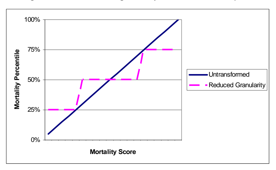
Figure 3. Effect of Recoding Mortality for Low-Volume Hospitals