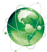
DITTA GLOBAL DIAGNOSTIC IMAGING, HEALTHCARE IT & RADIATION THERAPY TRADE ASSOCIATION