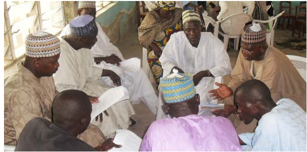
Local government officials and community representatives validate the LEAD Local Government Development Framework document in the Dass LGA of Bauchi State, July 2010.

Using its “With Many” approach, RTI is helping to broaden local development dialogue to include new voices by bringing together diverse community stakeholders to discuss concrete community issues and new strategies for solving them. For example, using this approach, LEAD simultaneously works at the state level to promote legislative changes that provide more citizen access to information and local decision making, especially related to budgeting; this increases the transparency of budget allocations from the state to local governments.