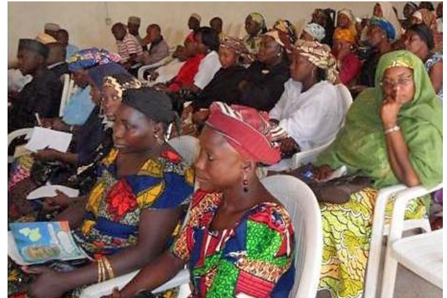
Women participate in a LEAD Community Mobilization Activity in Bauchi LGA, organized by Rahama Women Development Organization.

LEAD works with governments, civil society, and the private sector to strengthen the skills needed to create a more transparent and responsive governing environment. The project also aims to improve service delivery, especially in health and education. It is being implemented in the northern states of Bauchi and Sokoto.