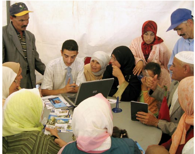
Women of the slum neighborhood of Ennakhil learn about low interest housing loans that could help them finance their new housing units.