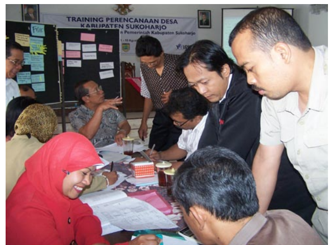
LGSP supports the Local Development Planning Agency of Sukoharjo, Central Java in training facilitators from 12 local villages in preparing long-term development plans.

Since 2005, LGSP has conducted numerous workshops and provided technical assistance to local government officials and citizens on public service management to help deliver better services to the community. LGSP also works with local councils to increase citizen participation and transparency in the budget process through a performance-based budgeting training series. As a result, a number of local districts have opened up their budgeting process and calendar to the public and are encouraging citizens to monitor the process.