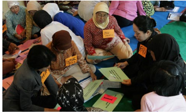
Women from Mojokerto, East Java, train to become planning forum (musrenbang) facilitators.

LGSP provides support and advice to partners at the local, provincial, and national levels, including the Ministry of Home Affairs (MOHA), the National Development Planning Agency (Bappenas), and government training centers (Bandiklat) in order to strengthen the enabling environment for good governance and ensure the sustainability of results. Part of this support consists of guidance on and formulation of regulations and guidelines. For example, LGSP assisted the