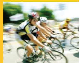
Create Competitive Advantage

Innovation is the currency for competitive advantage. So where will your next big idea come from? Will the solution you need be just around the corner, or half a world away? RTI extends your vision and reach so that you can identify growth opportunities in unexpected places and build the partnerships needed to stay ahead of the competition. That's innovation—explored.