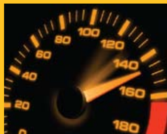
Increase Speed to Market