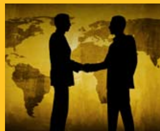
Connect to Partners