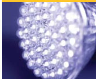
Discover Innovative Solutions